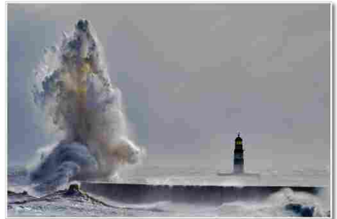
"Boom"

*Competition 5 – 'Home Town Pride' – entries due in