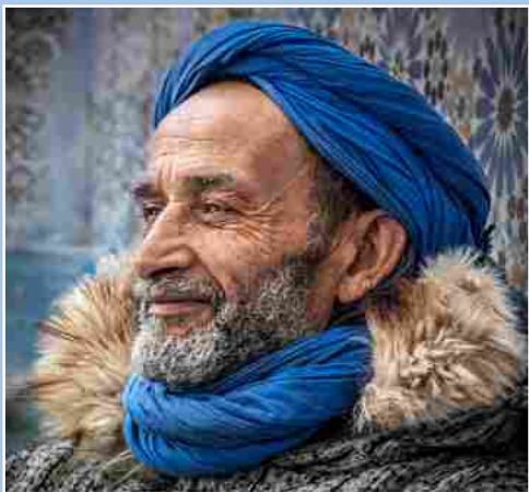
"At Peace With Himself" by Lyn Newton