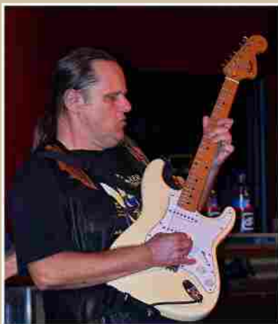
"Walter Trout"